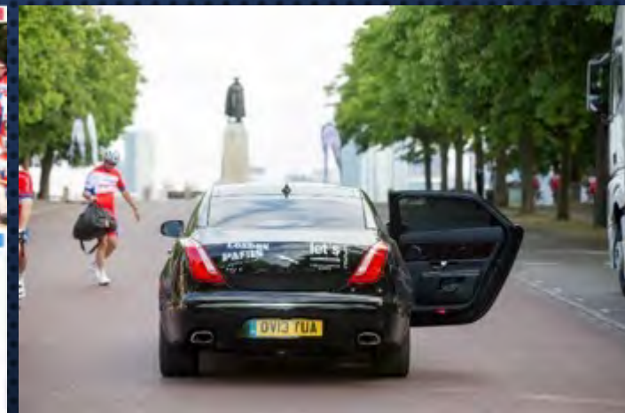
Support Vehicle Branding