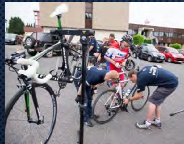
Mechanics, Physio & Crew branding