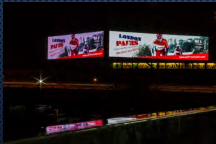
Weekly exposure on Elonex outdoor media boards