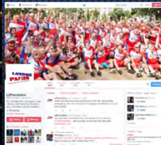
L2P Website & Social Media