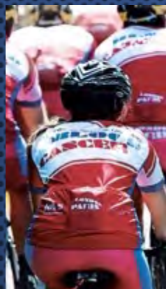
Back pocket branding