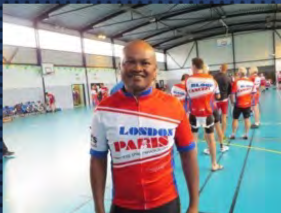
Front breast kit branding